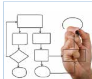
Roger establishes a plan of action with Ellen to determine the direction and resources needed and to help prioritize those resources.