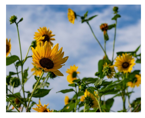
UNT gains new funding to help the Pecan Creek Pollinative Prairie project grow