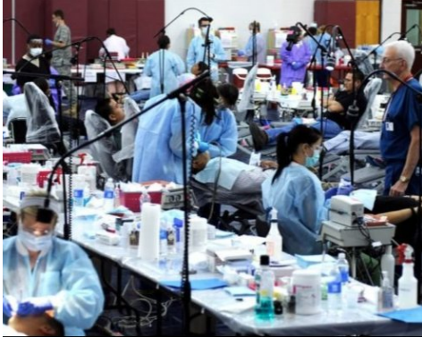
HSC, in partnership with \ensuremath{\mathsf{RAM}}\xspace , to continue free health clinic