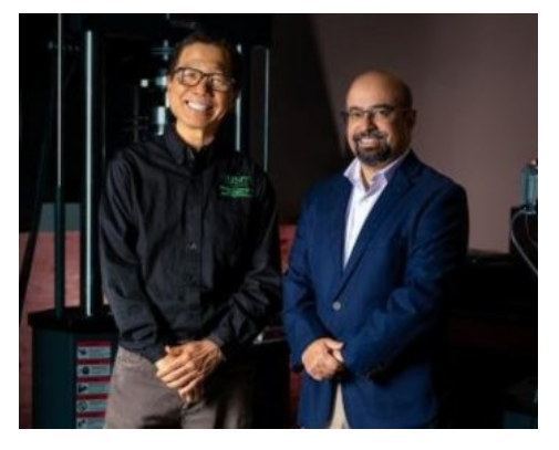
UNT engineering research to boost future manufacturing of critical military machinery