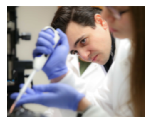
HSC College of Pharmacy granted eight-year accreditation