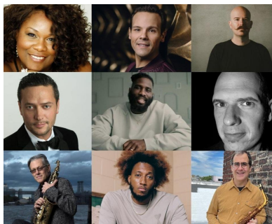
UNT alumni nominated for 2024 Grammy Awards