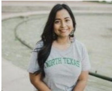
HSC Health social worker streamlines food delivery for needy patients