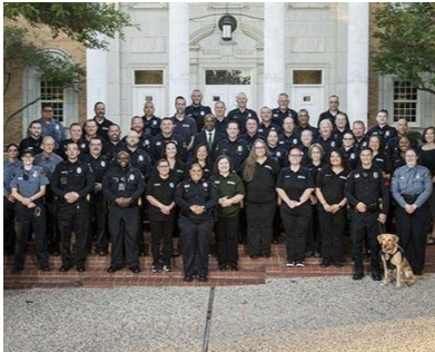
UNT Police Department again earns elite advanced law enforcement accreditation