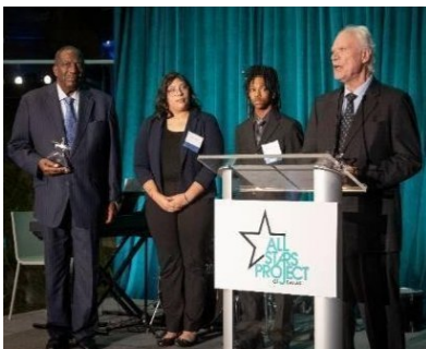
UNT Dallas names first recipient of Robert Mong Endowed Scholarship