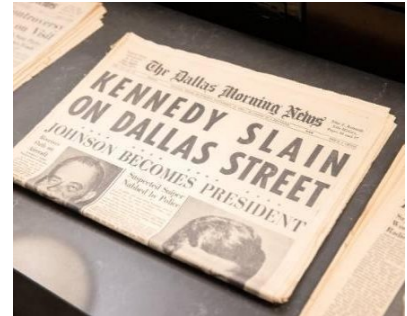
UNT Dallas College of Law remembers assassination of JFK 60 years later