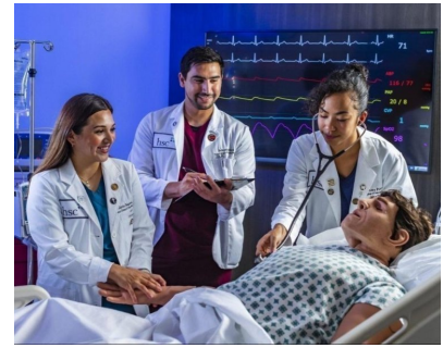
HSC takes home awards for public relations, communications