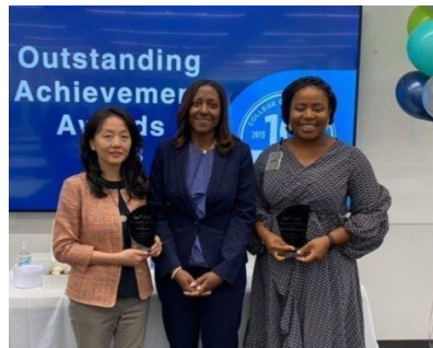
HSC College of Pharmacy names Outstanding Award recipients in Clinical Care and Research